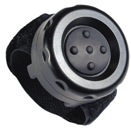
Model No. BT-PTT-Z (mini)

For use with Zello and Wave Communicator (on both Apple iOS and Android smartphones) push-to-talk apps.